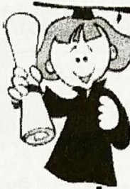
Base Salary Comparison